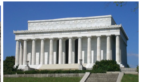
Lincoln Memorial Washington, D.C.