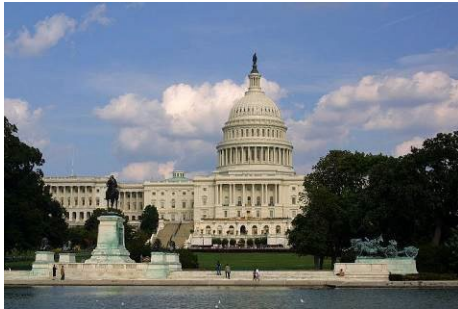
U.S. Capitol Building Washington, D.C.