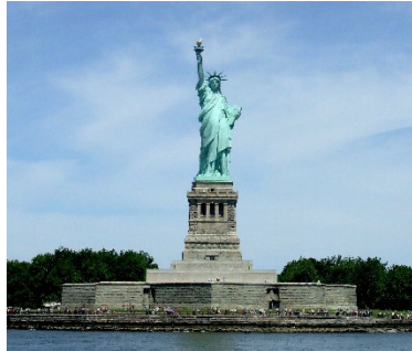
Statue of Liberty New York, NY