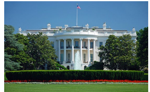
The White House Washington, D.C.