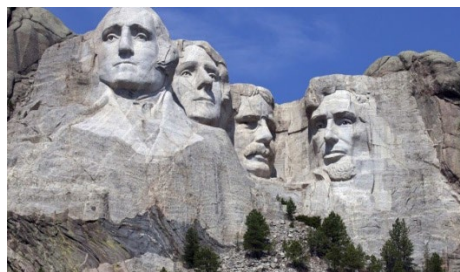
Mt. Rushmore Keystone, SD