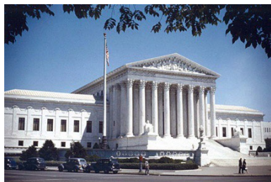
Supreme Court Building Washington, D.C.