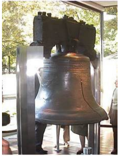
Liberty Bell Philadelphia, PA

Be able to correctly identify 8 out of these 10 monuments/symbols of the United States.